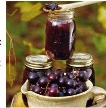
Tasty jams jellies and spreads.

Many people think of wines when they think of vineyards. Wine is just one of the many products made from the grapes. Jellies, jams, juices and spreads are some of the of the tasty offerings to consider.