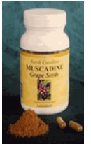
Muscadine grape seed is high in antioxidants and often used as a supplement to ward off illness

Muscadine grapes are naturally high in healthful antioxidants which is leading the expansion of the industry in North Carolina. Antioxidants help protect the body from the damaging effects of oxygen free radicals, which can contribute to degenerative diseases.